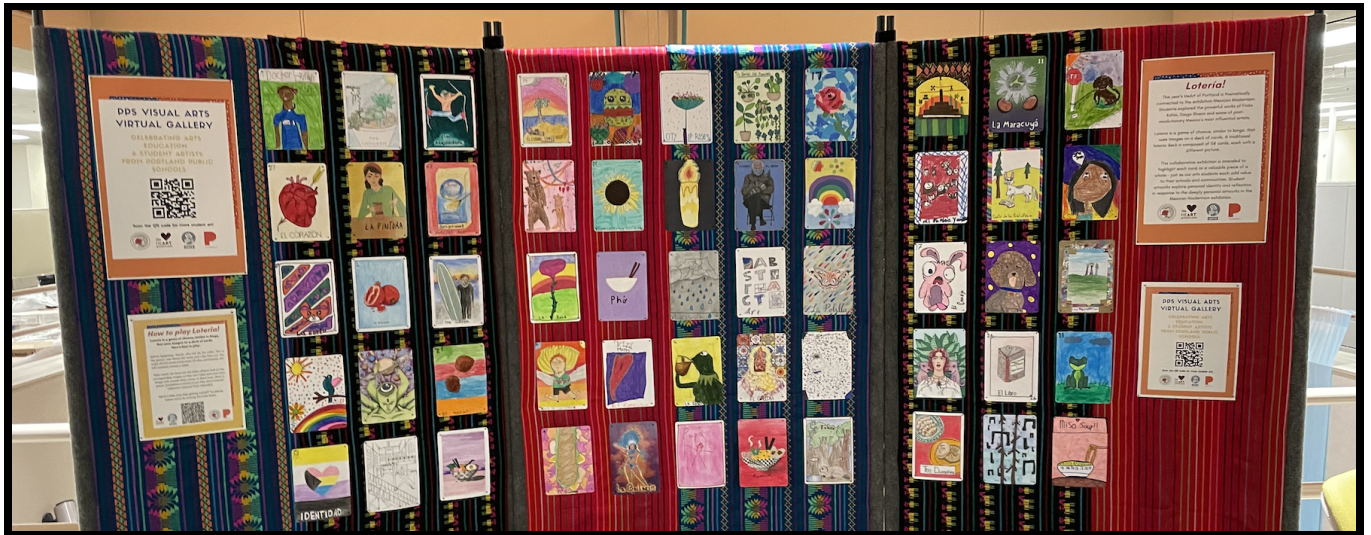
PPS Loteria deck on display at the BESC. Laynee's card is bottom right, second from right.